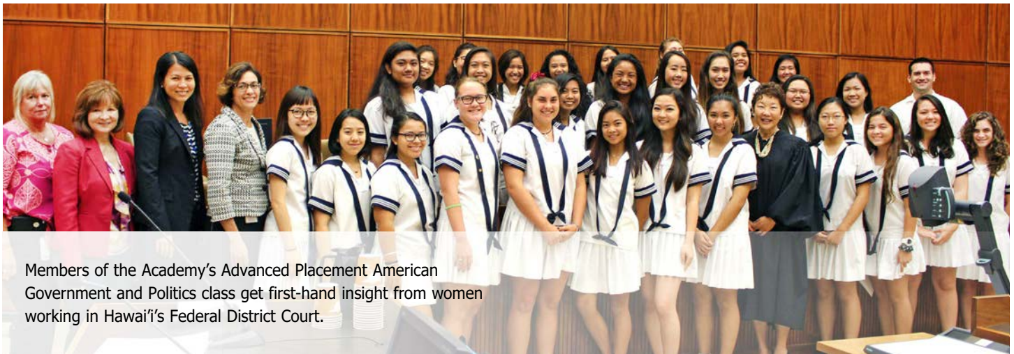
Members of the Academy's Advanced Placement American Government and Politics class get first-hand insight from women working in Hawai'i's Federal District Court.